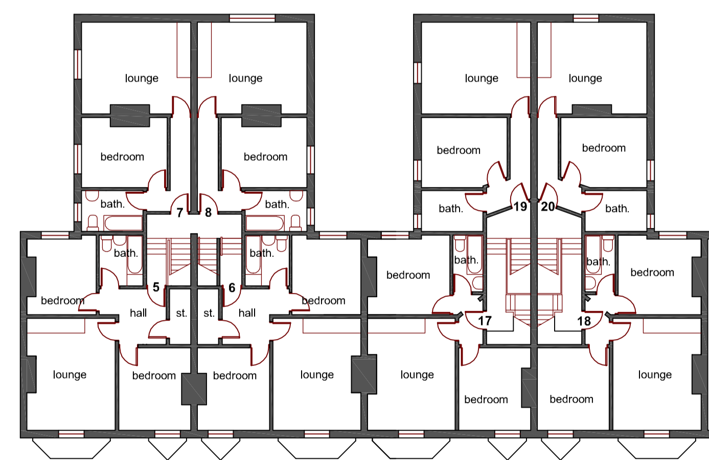
second floor plan