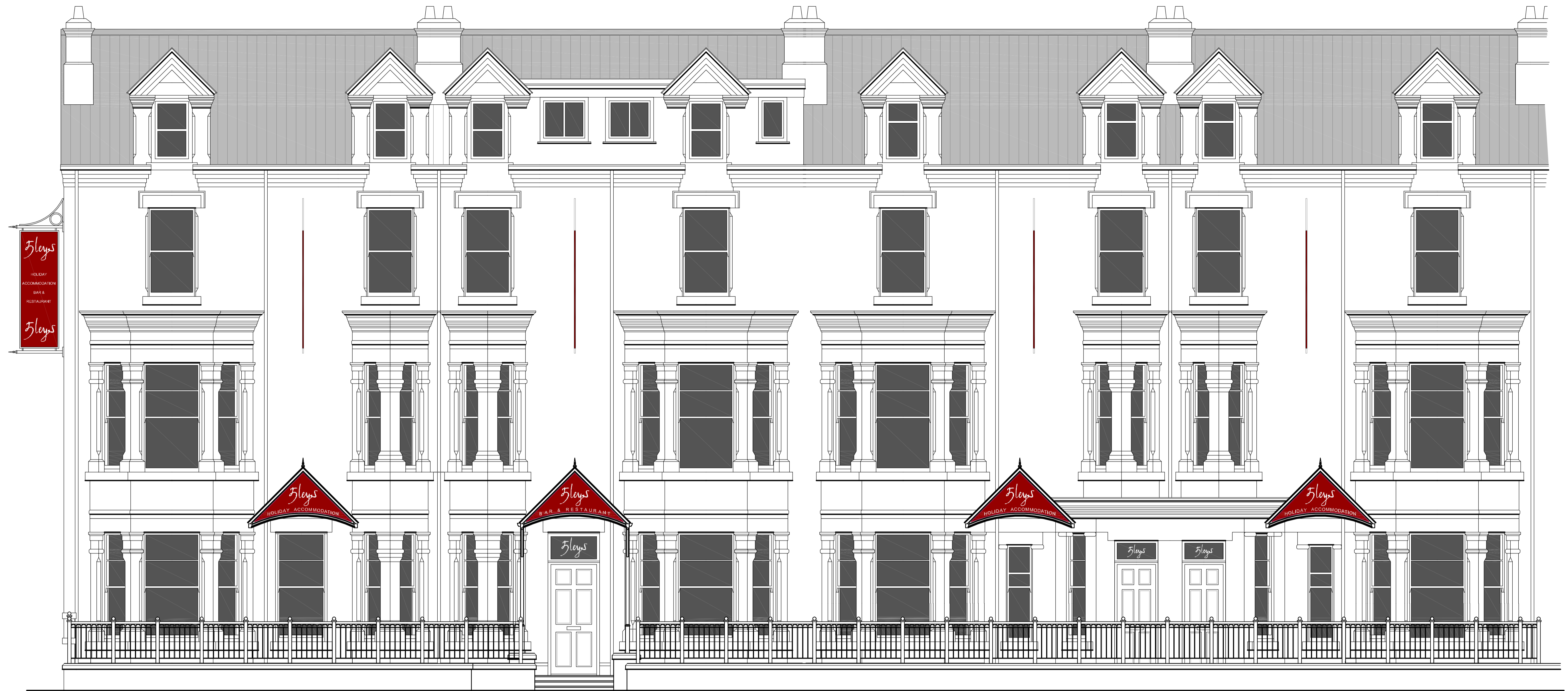
front elevation as proposed